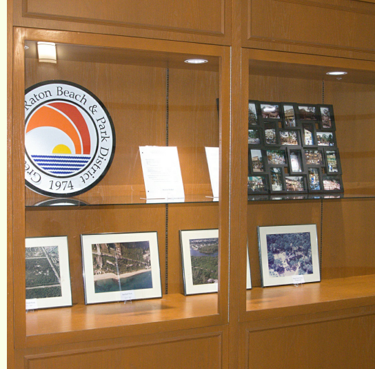
Exhibit On The Move

A landscaping crew began clearing invasive plants from North Park earlier this month. The crew started on the east end of the property beyond the Jeffery St. cul-de-sac, pulling invasive Hollies, Brazilian Peppers and other plants from the area near the railroad tracks. The removal is designed to return the park to its natural state. Walking and riding trails will ultimately be added to the park. Boca Paddle is also in the permitting process of creating an indoor/outdoor pickleball facility within the park.